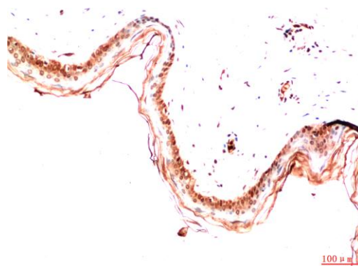
Immunohistochemical analysis of paraffin-embedded Human Skin Tissue using PDGFR a (TDY672) Mouse mAb diluted at 1:200