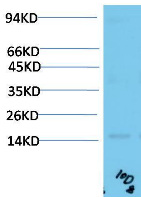
Western blot analysis of Human Serum using TTR (TDY707) Mouse mAb diluted at 1:2000.

Applications: WB-Western blot IHC-Immunochemistry IF-Immunofluorescence IP-Immunoprecipitation ChIP-Chormatin Immunoprecipitation Reactivity: H-Human R-Rat M-Mouse Mk-Monkey Dg-Dog Ch-Chicken Hm-Hamster Rb-Rabbit Sh-Sheep Pg-Pig Z-Zebrafish